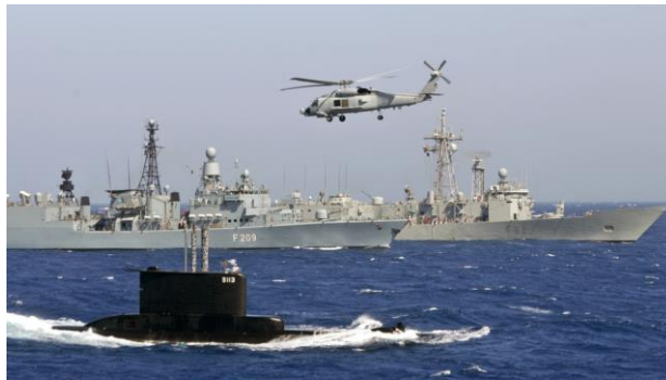
Figure 2: Maritime security task group underway

Maritime Security is “the combination of preventive and responsive measures to protect the maritime domain against threats and intentional unlawful acts”. Key words are: preventive and responsive measures, aiming at both law enforcement as a civilian and military requirement and defense operations as a military, in this case naval requirement.