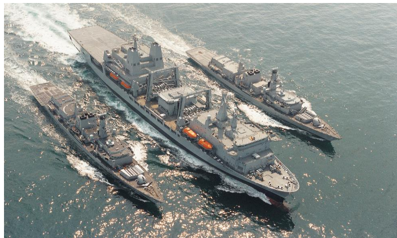
Figure 6: MSO Task Group conducting underway replenishment at sea

Logistics planning aims at ensuring responsive and usable logistics support to the naval forces and personnel participating to the NATO operations during the preparation and mission execution. So, the logistic support is responsible for planning and conducting the maintenance, materials and equipments acquisitions, personnel and forces insurance acquisition in order to ensure and maintain the operational status of the MSO deployable force - enhance the performance, efficiency, sustainability and combat effectiveness [8].