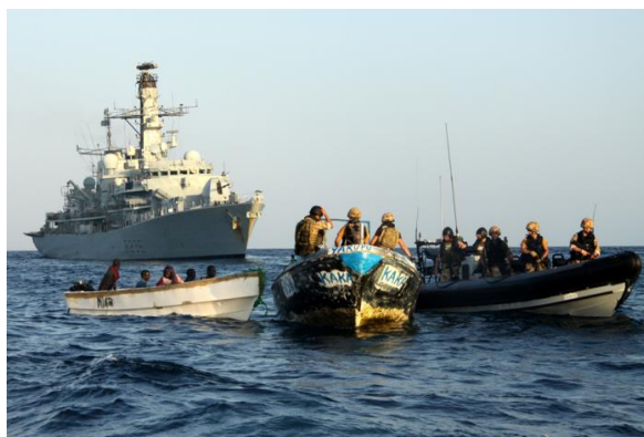
Figure 3: MS Task element counteracting maritime illegal activities

Since the Maritime Security Operations is a matter of legitimacy and jurisdiction, the Maritime Security Operations (MSO) might be defined as a type of maritime action conducted by a multinational naval force usually mandated by an international organization (United Nations, NATO, EU) for maritime governance, combating terrorism, migration, search and rescue, environmental protection and illegal activities – piracy and armed robbery, human trafficking and slavery.