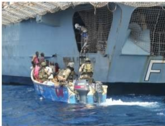
Figure 4: pirates captured by ROS REGELE FERDINAND - Operation Ocean Shield

In the last years the maritime community encountered various maritime security threats to the maritime environment such as maritime terrorism, illegal maritime migration, piracy, robbery, violence at sea, illegal exploitation of natural resources, illegal activity in protected areas, marine pollution, prohibited imports and exports and compromise to biosecurity.