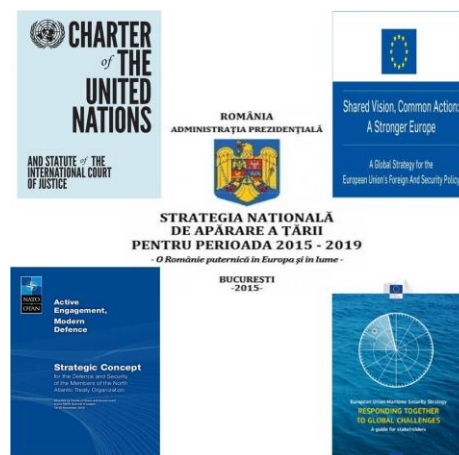
Figure 1: Main driven documents for national defense

Considering her attributes and responsibilities derived from her membership to UN, European Union and NATO, Romania drafted her own National Defense Strategy, White Book of Defense and Military Strategy in line with the allied similar ones having as center of gravity Romanian's values and interests. In this respect, the Romanian Armed Forces drafted its own doctrines and national laws in order to be ready to contribute to collective defense, crises management and cooperative security.